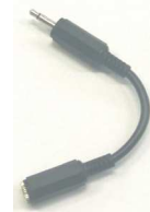
Scanner PC/IF Connector

Congratulations on your purchase of this GRE 30-3290 USB Scanner/PC Interface Cable for GRECOM scanners and RadioShack® Scanners. This cable allows you to connect many GRECOM and RadioShack® handheld, base and mobile scanners directly to your computer's Universal Serial Bus (USB) connectors, allowing convenient and simple programming of your scanning receivers.